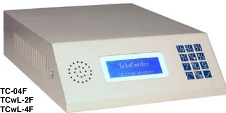
TC-04F TCwL-2F TCwL-4F