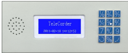
Front with speaker, LCD display, & keypad

Models TC-04F, TCwL-2F, and TCwL-4F 2 or 4 channels with built-in player and HDD