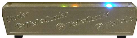
Front with power & channel activity lights

Models UC-02B & UC-04B 2 or 4 channels record to PC hard drive