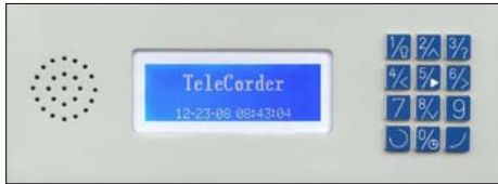
Front with speaker, LCD display, & keypad

Models TC-02F & TC-04F 2 or 4 channels with built-in hard drive