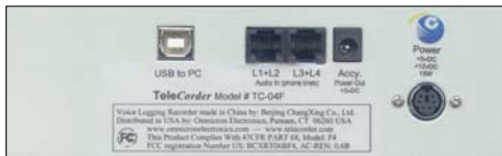
Back with input and output connections