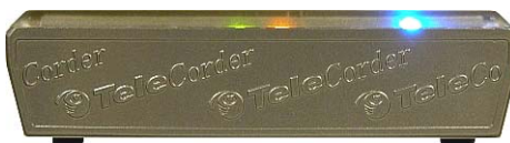
Front with power & channel activity lights

Models UC-02B & UC-04B 2 or 4 channels record to PC hard drive